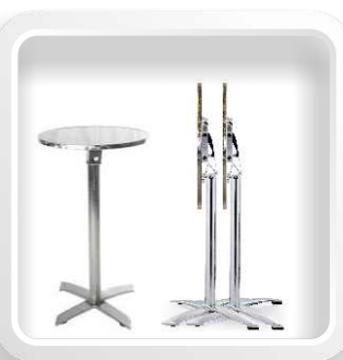
TABLE & DRY BAR COVERS

EZI-FLOR Dry Bar Tables have a 600mm stainless steel folding top. The base gives the ability to stack the tables together using minimal storage.