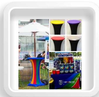
TABLE & STAGE SKIRTING

EZI-FLOR are suppliers of quality Australian made lycra and polyester covers to suit round, rectangle, square and dry bar tables.